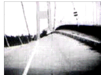
Figure 23-29: Animation Available in individual lecture, deleted here because of filesize constraints The Tacoma bridge disaster is perhaps one of the most well-known failures that resulted directly from resonance phenomena. It is believed that the the wind blowing across the bridge caused the bridge to vibrate like a reed in a clarinet. (Images from Promotional Video Clip from The Camera Shop 1007 Pacific Ave., Tacoma, Washington Full video Available http://www.camerashoptacoma.com/ )