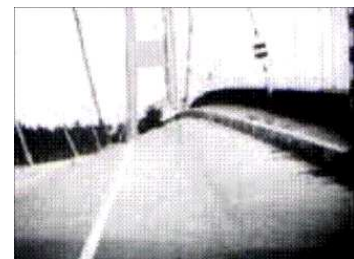
Figure 23-2: The Tacoma bridge disaster is perhaps one of the most well-known failures that resulted directly from resonance phenomena. It is believed that the the wind blowing across the bridge caused the bridge to vibrate like a reed in a clarinet.